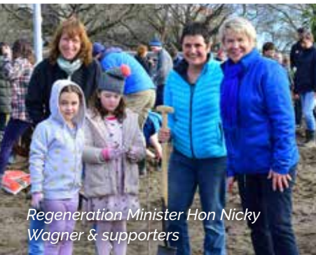
Regeneration Minister Hon Nicky Wagner & supporters