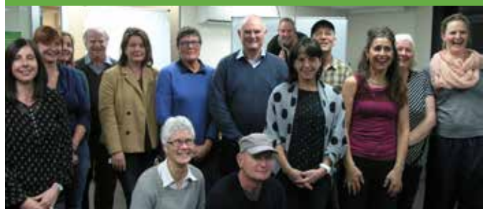
Congratulations to our participants from the July Fundamentals of Horticulture Course - a great bunch of gardeners looking forward to applying their new skills!