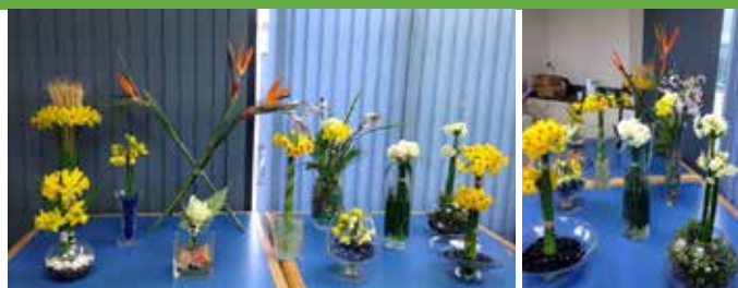
The latest colourful creations from the Floral Design Group. Next meeting Wed 20 September, come along!

More details: www.chsgardens.co.nz/hortskills-principles