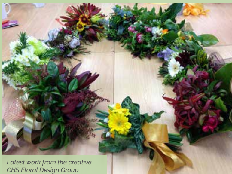
Latest work from the creative CHS Floral Design Group