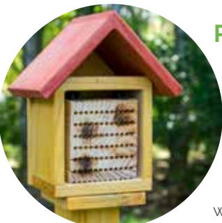
Leafcutter Bee House

Adding to this opportunity, gardeners now have the unique option to purchase live bumble bee colonies or try their hand at raising the wonderfully gentle-natured leafcutter bees – a perfect way to get involved and play your part in a home-grown solution for everyone.