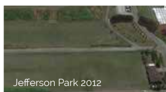
Jefferson Park 2012

After 2 years since winning our contract with CERA, we are on track to complete a similar open-harvest food forest and vegetable gardens in addition to a state-of-the-art sustainable building hosting a cafe, meeting spaces, and new headquarters for the CHS.