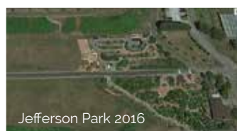
Jefferson Park 2016