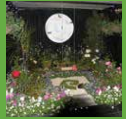
St Albans Catholic School Scented Night Garden