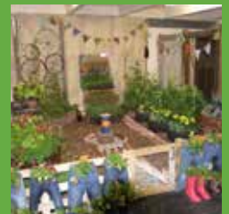
West Spreydon School Trash to Treasure