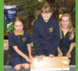
West Melton Primary students celebrate their award

We want to make this event a major "must see" in Christchurch's calendar and demonstrate our commitment to horticultural innovation among the city's younger generation on whom our future depends. We need your help! Please tell your neighbours and friends about it and encourage them to see the show, and if you have children or grandchildren please take them so they may be inspired by the creativity of their peers and wish to emulate them!!