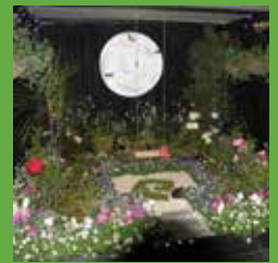
St Albans Catholic School Scented Night Garden

We want to make this event a major "must see" in Christchurch's calendar and demonstrate our commitment to horticultural innovation among the city's younger generation on whom our future depends. We need your help! Please tell your neighbours and friends about it and encourage them to see the show, and if you have children or grandchildren please take them so they may be inspired by the creativity of their peers and wish to emulate them!!