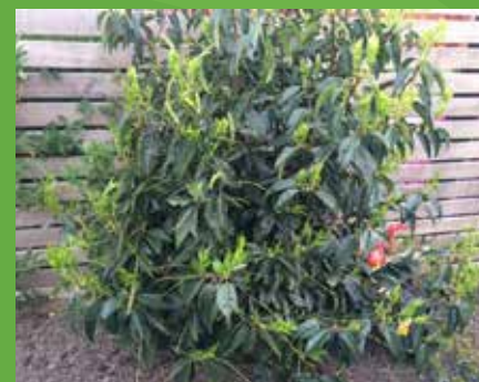
Portuguese Laurel - healthy and diseased (probably infected with fireblight)