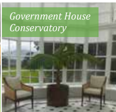
Government House Conservatory