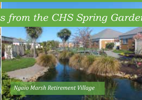
Ngaio Marsh Retirement Village