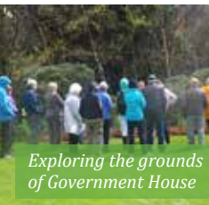
Exploring the grounds of Government House