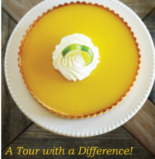
A Tour with a Difference!